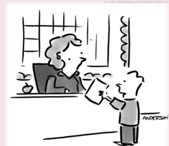
"To show you how well I understand fractions, I only did half of my homework."