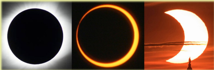
From left to right, these images show a total solar eclipse, annular solar eclipse, and partial solar eclipse.

A total solar eclipse happens when the Moon passes between the Sun and Earth, completely blocking the face of the Sun. People located in the center of the Moon's shadow when it hits Earth will experience a total eclipse. The sky will darken, as if it were dawn or dusk. Weather permitting, people in the path of a total solar eclipse can see the Sun's corona, the outer atmosphere, which is otherwise usually obscured by the bright face of the Sun. A total solar eclipse is the only type of solar eclipse where viewers can momentarily remove their eclipse glasses (which are not the same as regular sunglasses) for the brief period of time when the Moon is completely blocking the Sun. The next total solar eclipse in the U.S. will be on April 8, 2024 .